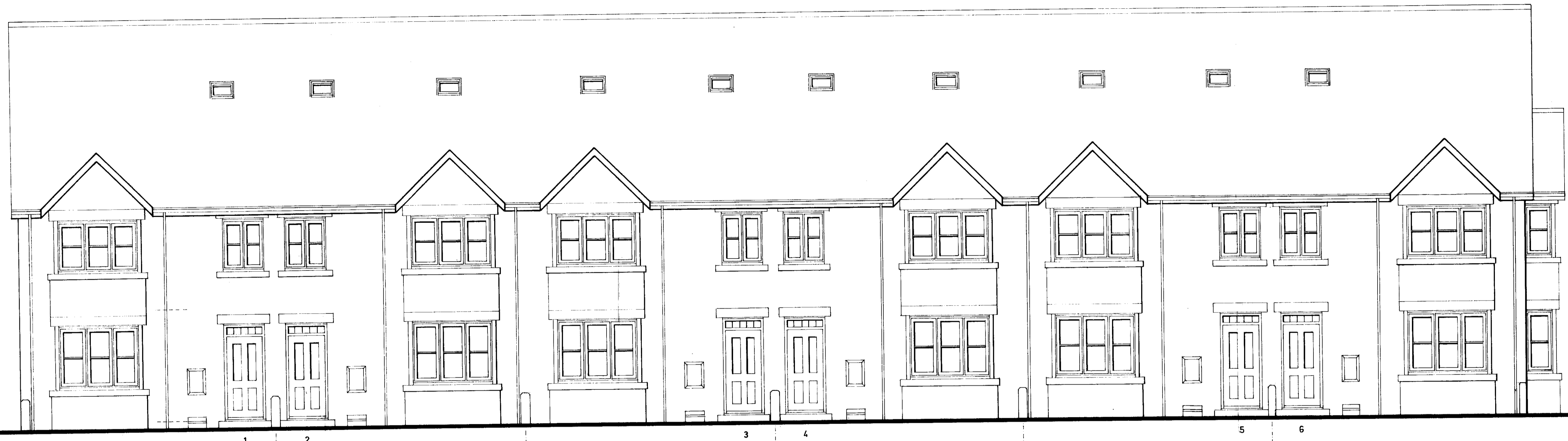
Site South Facing Tynemouth Road